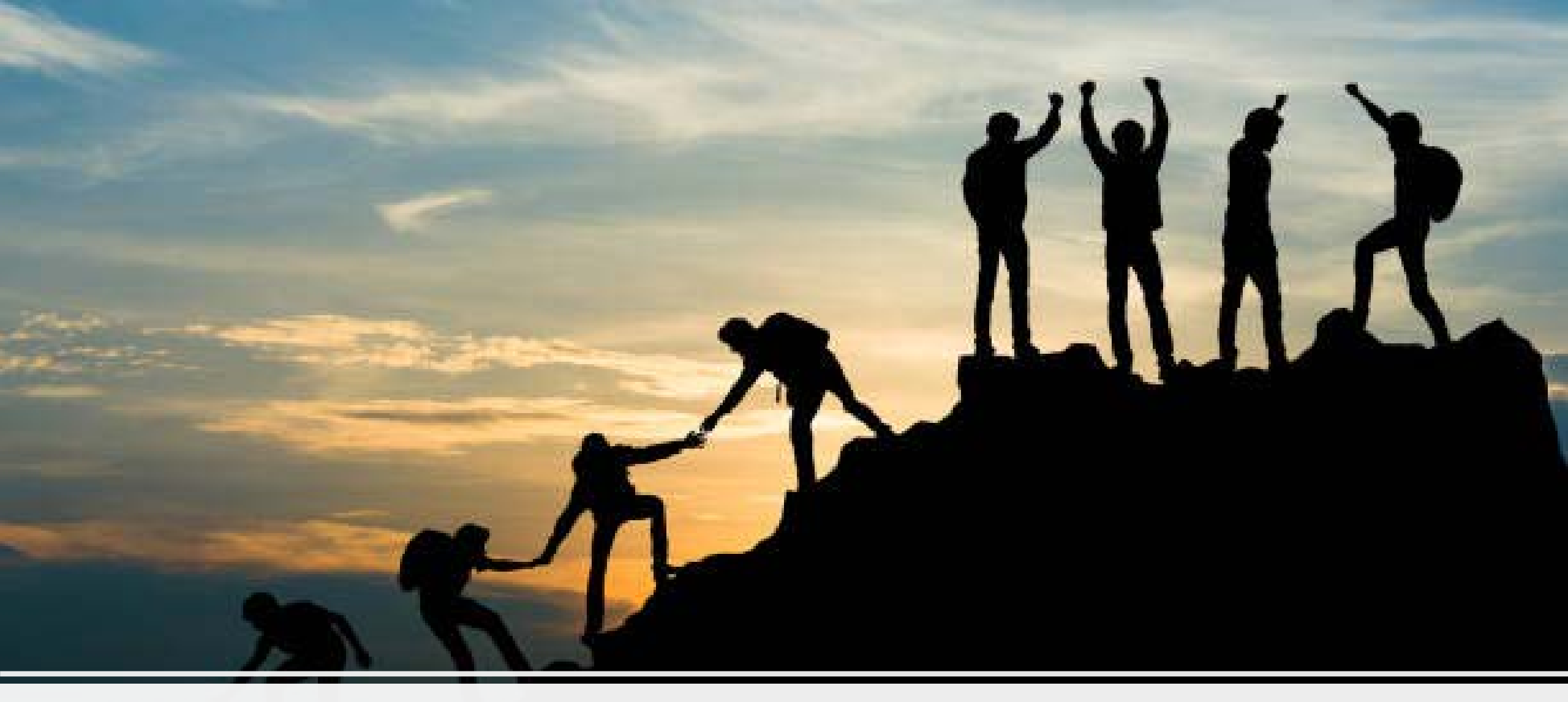
2021 and beyond