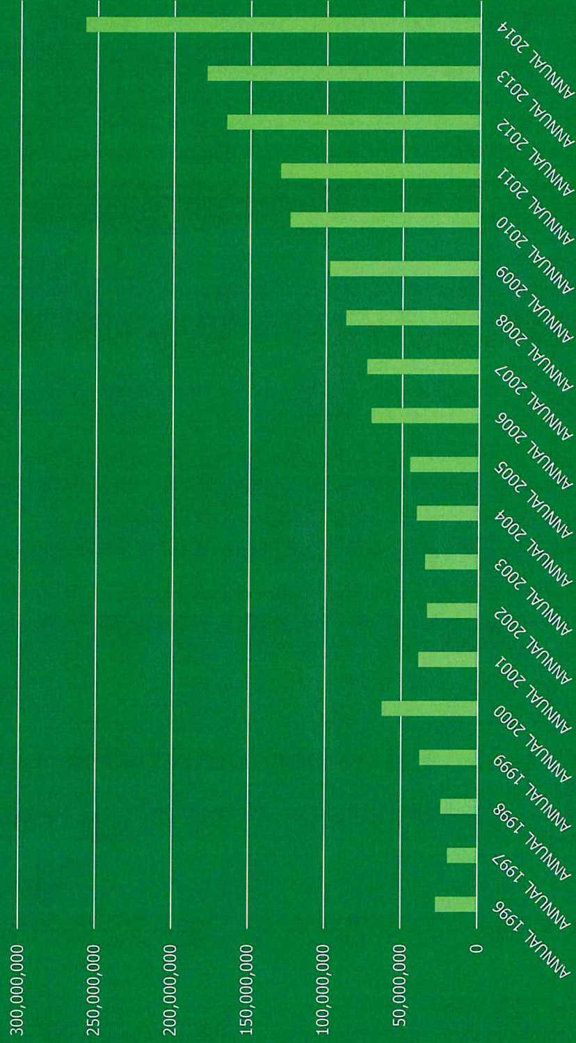
Total Ag Exports